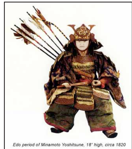
Edo period of Minamoto Yoshitsune, 18" high, circa 1820